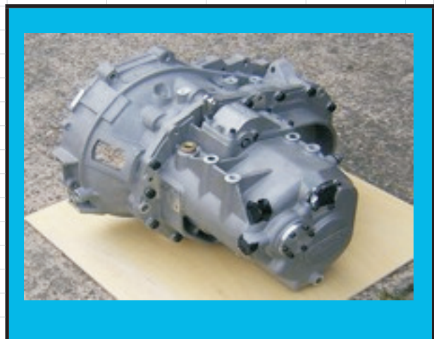
With New MaKTrak Lancer Bellhousing